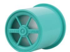
PMV® 007 (Aqua Color™)

It provides patients the opportunity to speak uninterrupted without having to wait for the ventilator to cycle and without being limited to a few words as experienced with "leak speech." By restoring communication and offering the additional clinical benefits of improved swallow, secretion control and oxygenation, the Passy-Muir Valve has improved the quality of life of ventilator-dependent patients for 25 years.