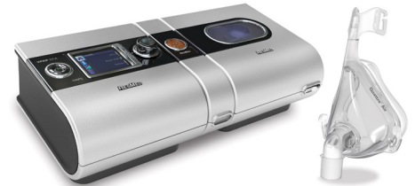
S9 VPAP™ ST-A with iVAPS

The S9 VPAP™ ST-A with iVAPS (intelligent Volume-Assured Pressure Support) provides personalized non-invasive ventilation therapy. It offers all the comfort features of the S9 device such as climate control, along with iVAPS that automatically changes pressure support based upon the therapy pressure required to reach the set therapy target. Combined with the lightweight Quattro Air full face mask, ResMed delivers a complete therapy solution designed for performance and comfort.